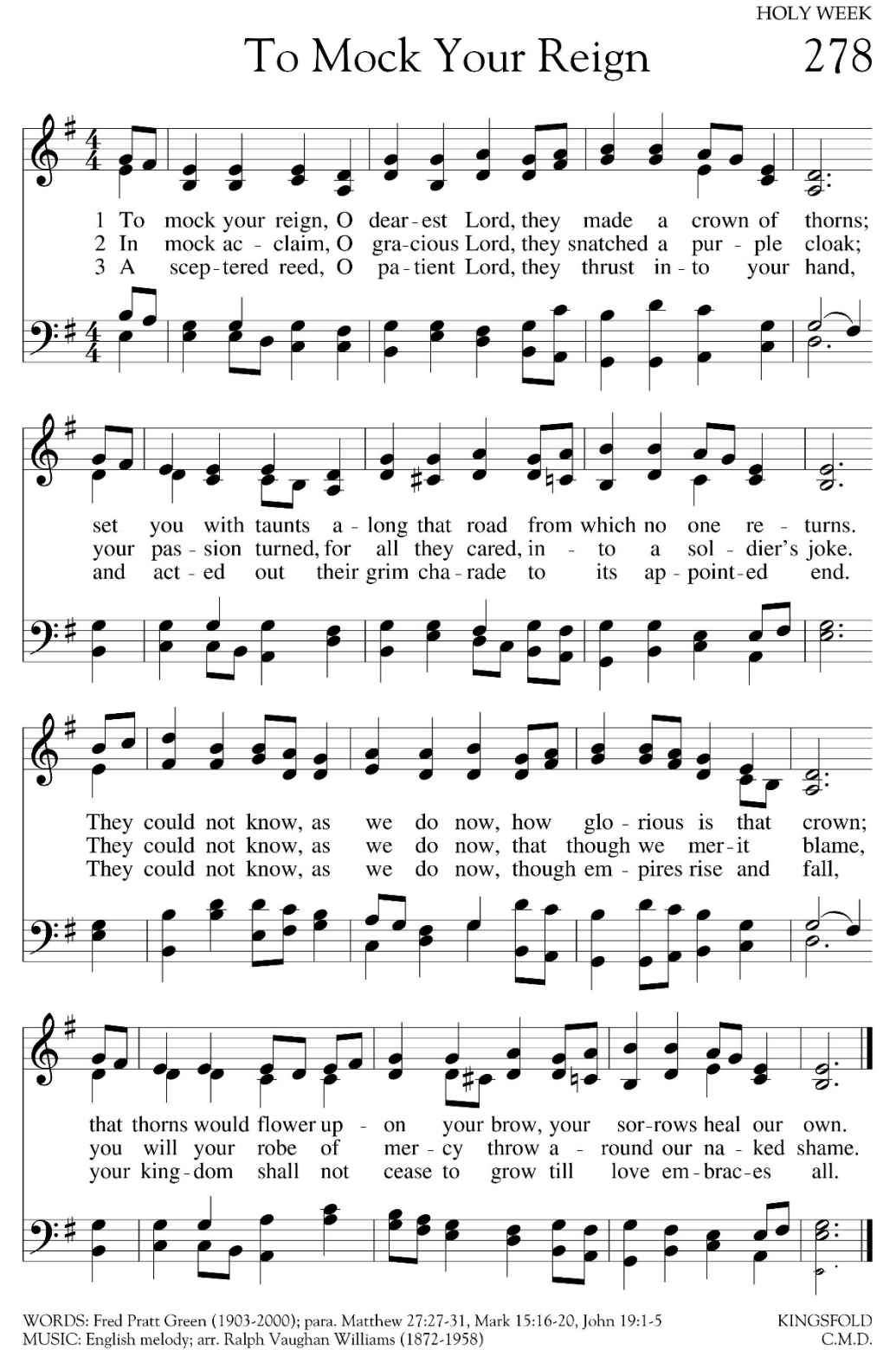
Words © 1973 Hope Publishing Company